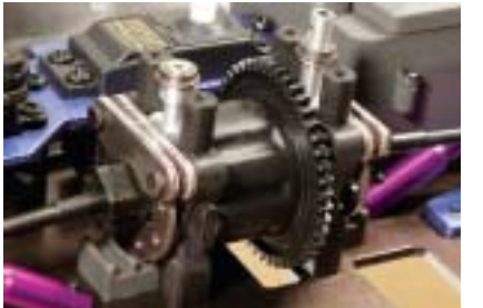
The Torpeda's center diff features a steel spur gear and single-disc front and rear brakes with brake disk guides