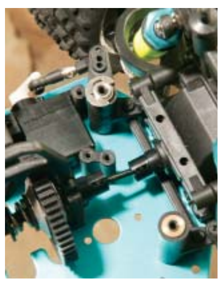
Bushing-supported bellcranks handle the steering duties with a servo saver built into the main crank.