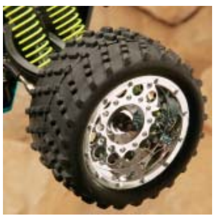
The wheel/tire combo on the Mini Cobra is perfect for bashing; the chevron tread will work on anything from dirt to pavement.