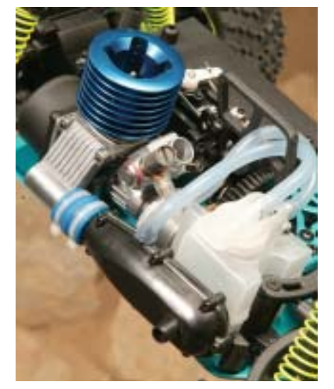
Here is a full view of the Cobra's power center: engine, pipe and fuel system. Just like the big stuff, just smaller!