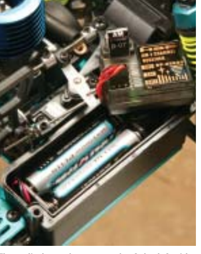
The radio box takes up much of the left side of the chassis and houses everything but the servos. To power the truck, Himoto used a super small four-cell AAA receiver pack.